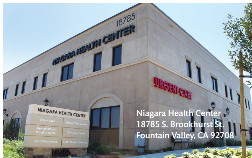
Niagara Health Center 18785 S. Brookhurst St. Fountain Valley, CA 92708

For questions about Medicare, health plans accepted by GNP or assistance with selecting the right PCP for you or your family, call GNP Customer Service at 800-553-6537 .